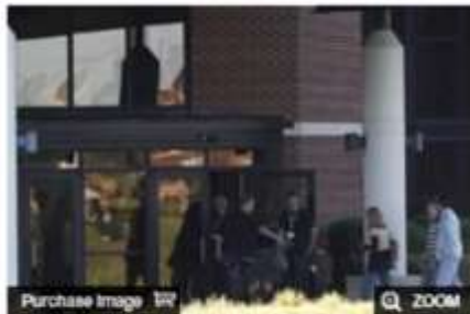
Members of the Springdale Community Church and Spring Creek subdivision attend a church service at the church on Springdale Road in Louisville, Kentucky, September 9, 2012